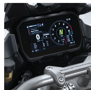
Ducati Connect system (Only on the V4 S)