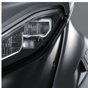
Ducati cornering lights