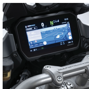
6.5" colour TFT Display (Only on the V4 S)

The future of riding pleasure at your disposal. Now.