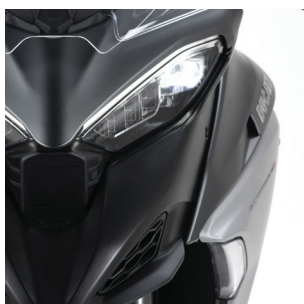
Full LED lighting