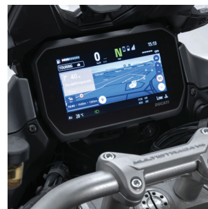
6.5" colour TFT display