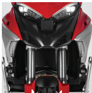
Semi active Skyhook suspension