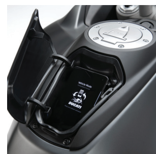
Waterproof phone compartment