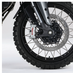
300 mm Brembo M50 Stylema brakes