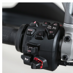
Innovative joystick control (Only on the V4 S)