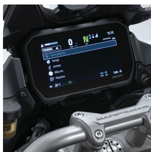
Ducati media system